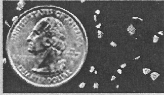
Surface Application Rate Sprinkle Preen Garden Weed Preventer as shown on soil surface.

For flowers, roses, herbs, ground covers, ornamental grasses, shrubs, trees and listed vegetables at least 2"-3" tall (see special section for use on vegetables): sprinkle Preen Garden Weed Preventer evenly over the entire soil surface, at the rate of 1 oz. per 10 sq. ft. (see picture on right), being sure to keep granules away from plant roots and foliage.