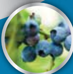
FRUITS & NUTS

IDEAL FOR USE: AROUND ROSES, LISTED SHRUBS & TREES