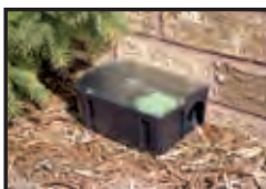
EXTERIOR OF HOMES

Must adhere to the USE RESTRICTIONS in the DIRECTIONS FOR USE section of this label.