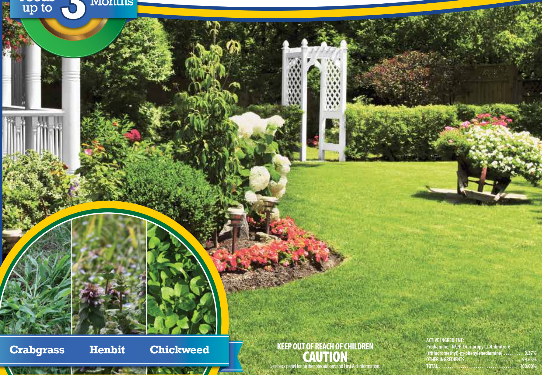
Crabgrass Henbit Chickweed

KEEP OUT OF REACH OF CHILDREN CAUTION See back panel for further precautions and First Aid information.