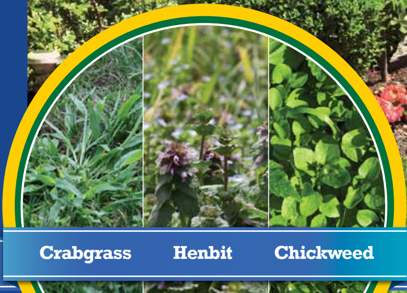
Crabgrass Henbit Chickweed